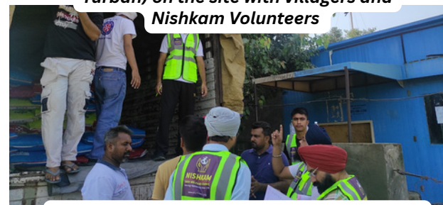
On the ground Zero: Providing relief services in Punjab Floods in 2023 and 2025