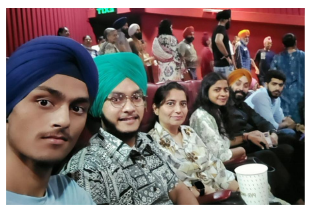
Enjoying the ambience: Nishkam Audience