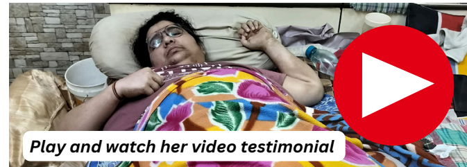
Play and watch her video testimonial