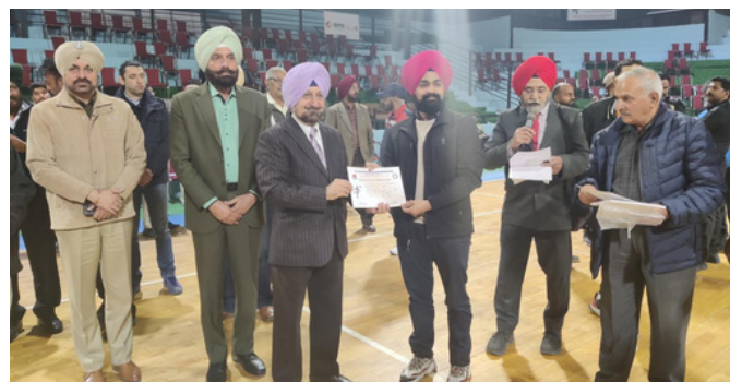
Whille getting the honor in a sports meet