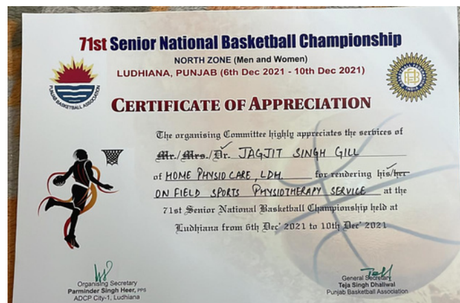
Certificate of Honor