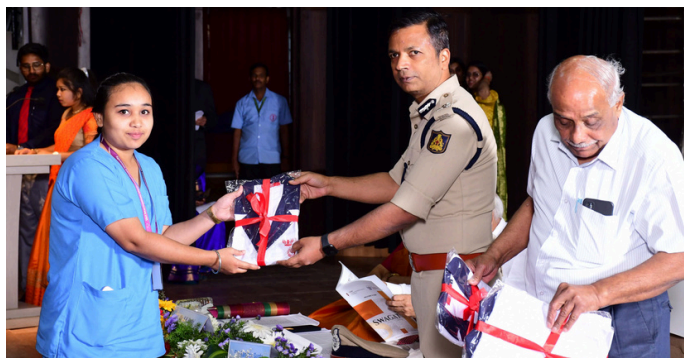
While getting the Official Blazer after the Oath Ceremony