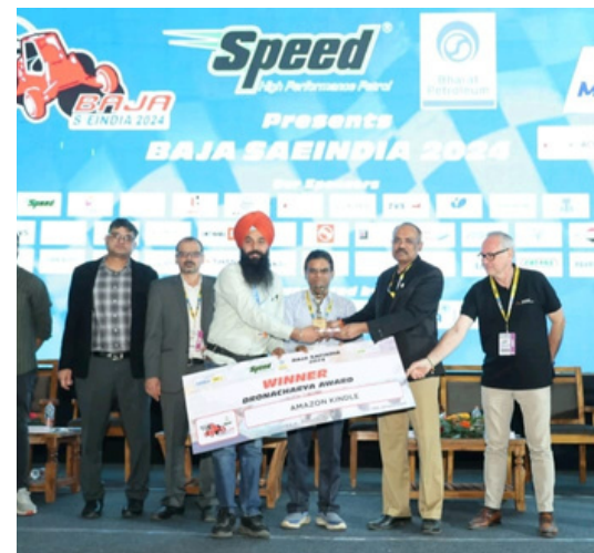
Dronacharya Award - mBAJA 2024 Conferred by Society of Automotive Engineers, India.

Education: M.Tech in Industrial Engineering