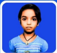
NIRMLA CLASS- 4