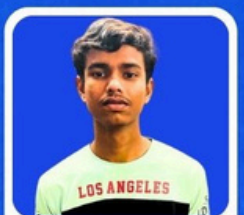
ROHAN CLASS- 9