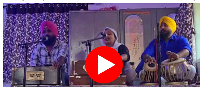
A versatile performer, singing shabads Watch the Video !