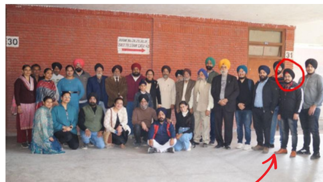
Year 2021- While volunteering opportunity at Sukho Khalsa School- Delhi