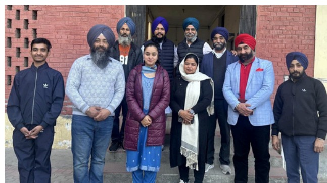
Interview Team at Guru Nanak Dev Engineering College at Ludhiana