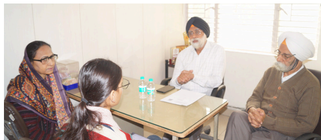
Students addressed by the Nishkam Sewadars at Delhi

Notwithstanding temporary financial challenges, the dedicated Team of Nishkam volunteers decided to continue with its annual scholarship program by extending its outreach to prospective donors to raise funds required for funding yearly scholarships of up to Rs 40k to 60 students who excelled in the written test and interactive sessions.