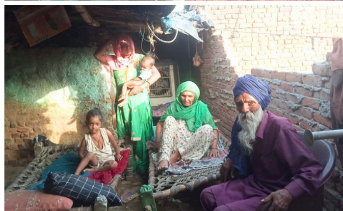
The beneficiary family at Aligarh, UP