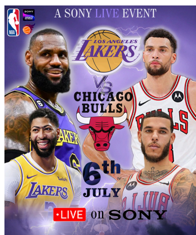
Work By- Vikramjeet