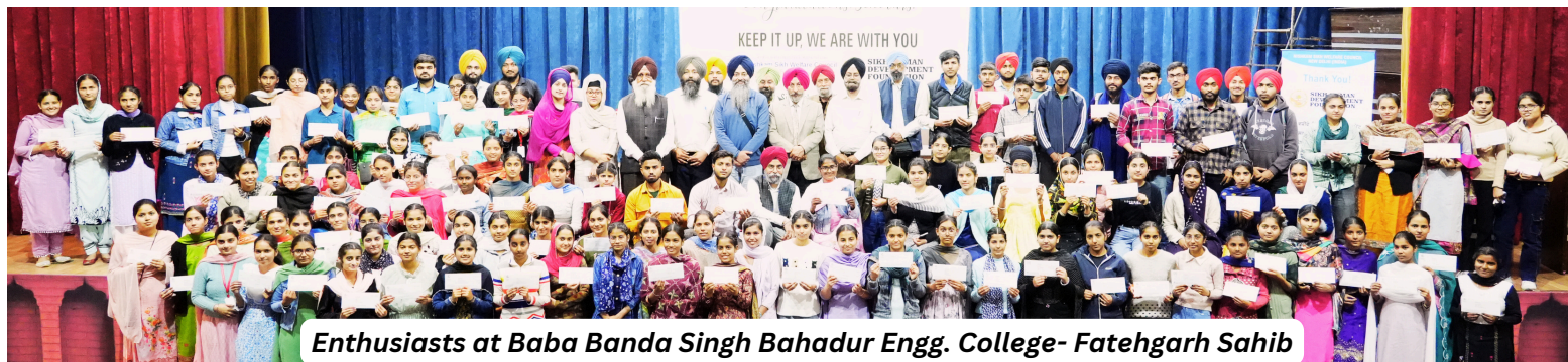
Enthusiasts at Baba Banda Singh Bahadur Engg. College- Fatehgarh Sahib

The Sikh Human Development Foundation, USA and Nishkam Sikh Welfare Council have awarded scholarships to 2144 scholars (SHDF and Nishkam's Merit cum Means Scholarships) worth Rs. 5.65 Crore for 2023-24. The funds are being used to support students belonging to underprivileged families pursuing professional courses at universities and colleges in Punjab, Delhi, and neighbouring states. The support from donors has helped these students overcome financial struggles and become future technocrats, managers, analysts, entrepreneurs and leaders. This year the scholarship distribution events were held in two rounds in March and May 2024 across new institutions at Khalsa College for Women- Amritsar, Ramgarhia Girls College- Ludhiana and Baba Banda Singh Bahadur Engg. College- Fatehgarh Sahib. We express gratitude to our associates and donors for their consistent financial support in transforming lives.