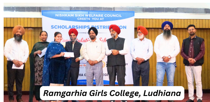
Ramgarhia Girls College, Ludhiana