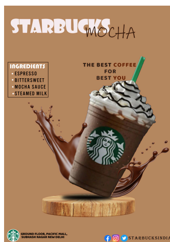
Work By- Gurpreet