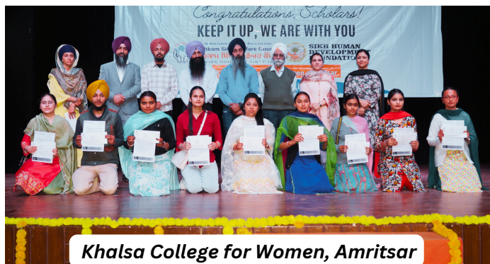
Khalsa College for Women, Amritsar

The Sikh Human Development Foundation, USA and Nishkam Sikh Welfare Council have awarded scholarships to 2144 scholars (SHDF and Nishkam's Merit cum Means Scholarships) worth Rs. 5.65 Crore for 2023-24. The funds are being used to support students belonging to underprivileged families pursuing professional courses at universities and colleges in Punjab, Delhi, and neighbouring states. The support from donors has helped these students overcome financial struggles and become future technocrats, managers, analysts, entrepreneurs and leaders. This year the scholarship distribution events were held in two rounds in March and May 2024 across new institutions at Khalsa College for Women- Amritsar, Ramgarhia Girls College- Ludhiana and Baba Banda Singh Bahadur Engg. College- Fatehgarh Sahib. We express gratitude to our associates and donors for their consistent financial support in transforming lives.