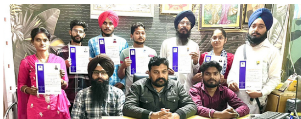
Completion of Course