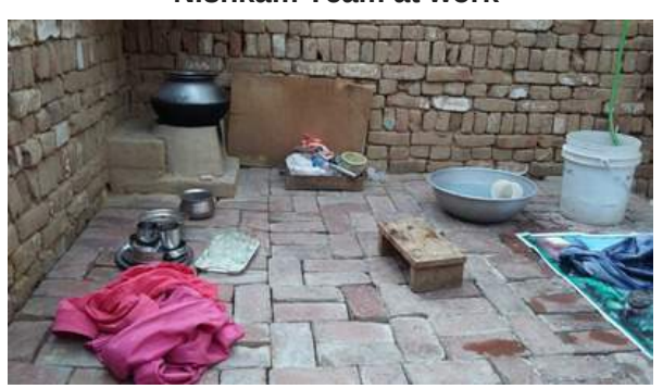
The humble setup at home