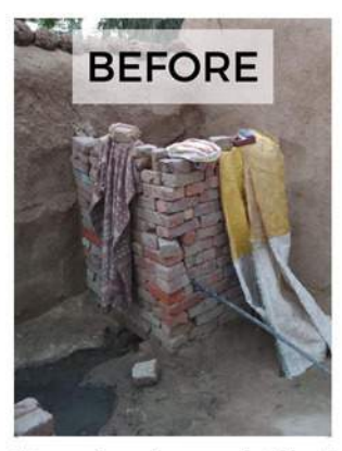
Transforming a shabby bathroom/toilet