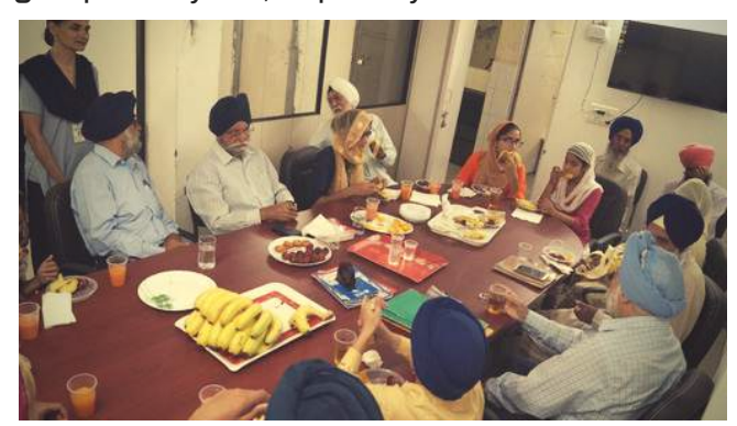
The gathering enjoying breakfast