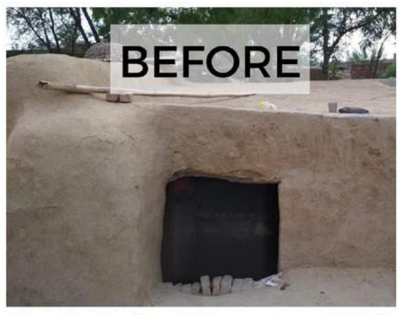
Transforming lives: Built pucca house at Tehsil Patti in Amritsar of poverty-stricken family