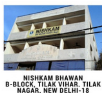
NISHKAM BHAWAN B-BLOCK, TILAK VIHAR, TILAK NAGAR, NEW DELHI-18

ACTIVITIES AT NISHKAM BHAWAN PROJECT OFFICE